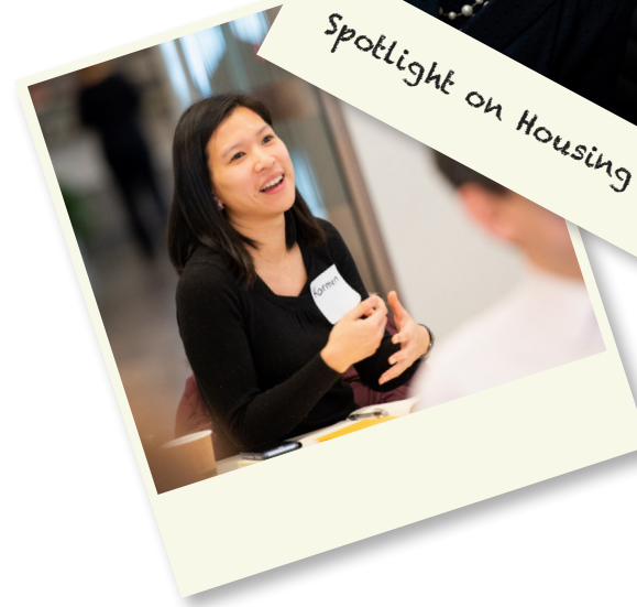
Spotlight on Housing Choice

Regional Housing Network of Massachusetts Regions / First Sterling Related Beal Revitalize Community Development Corporation (Revitalize CDC) Rhode Island Housing Rockland Trust Rockport Mortgage Corporation Rogerson Communities Rural Development, Inc. Salem Five Charitable Foundation Salem Five Mortgage Company South Middlesex Opportunity Council (SMOC) Springfield Housing Authority TD Bank Technical Assistance Collaborative, Inc. Tenants' Development Corporation The Caleb Group The Community Builders The Housing Partnership Network The Life Initiative The Neighborhood Developers The NHP Foundation The Pelham Corporation The Schochet Companies Trinity Financial, Inc. Trinity Management, LLC Urban Edge Housing Corporation US Housing Consultants Vinfen Corporation Watertown Housing Authority Way Finders WinnCompanies WNC Women's Development Corporation Women's Institute for Housing and Economic Development (WIHED) Worcester Community Housing Resources, Inc.